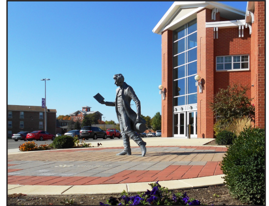
Lincoln Sculpture Circle

Stadium seat, locker and paver sponsorships are considered charitable gifts to the Lincoln Center Building Fund and are tax deductible as allowed by law.